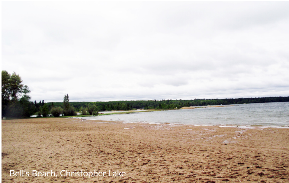
Bell's Beach, Christopher Lake