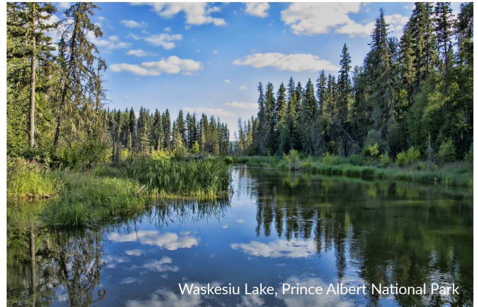
Waskesiu Lake, Prince Albert National Park

The Northern Saskatchewan Forest has also blossomed many ecotourism wonders including Sled Dogs Excursions, Land of the Loon Resort, Jewel of the North and WhiteTail Hunting Company. Every one of these spectacular activity centers are located only minutes from Christopher Lake.